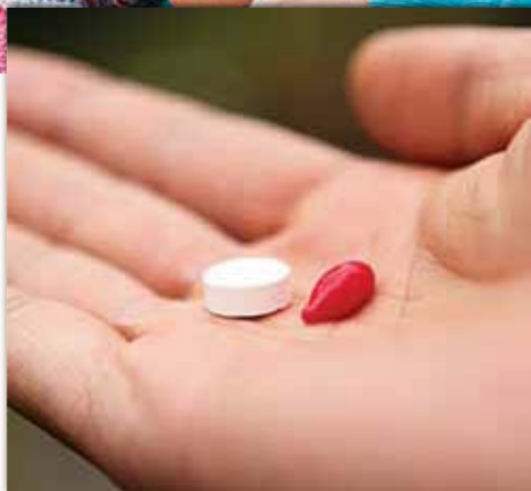
Deworming medicine and vitamin A: a simple cure that greatly improves a child's health.

Because of contaminated water and poor hygiene, her children had stomachaches, constant diarrhea and scabies. They were too weak to attend school. Even when they could attend, they were often sent home because