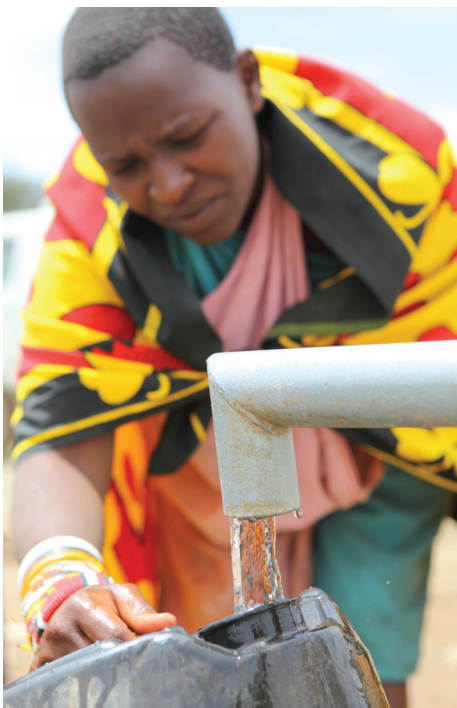
Bringing clean water to families in Kenya is a top priority.