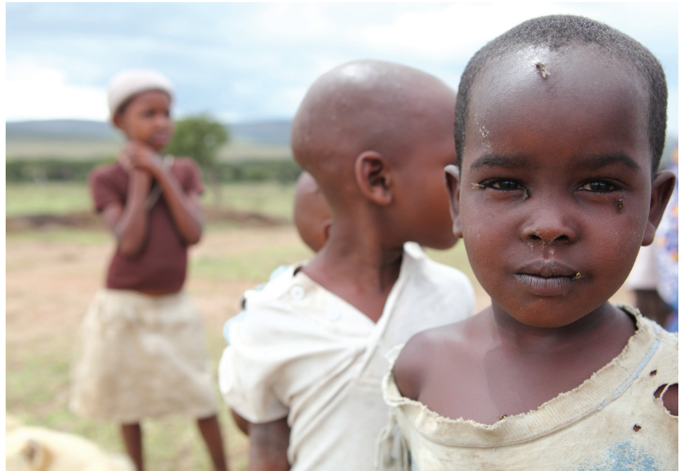
Children in Kenya often lack basic necessities like clean water, health care, and education.

Despite a well-known tourism industry and developing economy, Kenya suffers troubling issues: an HIV and AIDS infection rate that is more than 11 times higher than the U.S., extreme poverty, and rampant disease from lack of access to clean water. Many Kenyans have been left out of—or even harmed by—the country’s development. One fourth of Kenya’s children do not attend school. Often, their parents’ livelihood has been hampered by drought. Mothers walk for miles to retrieve water for their families from filthy ponds. Thousands of children have been orphaned by AIDS.